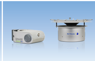
DR-Series Direct Room humidification