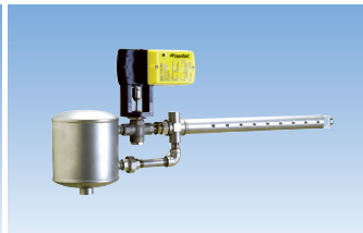
LS-Series Pressure steam humidification