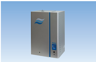
EL-Series Electrode steam humidification

Facilities and Operation Manager, Itron Inc.