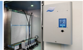
ME-Series Media Evaporative cooling & humidification

As the leading manufacturer of commercial/industrial humidification systems for more than 40 years, Nortec has the technology and application expertise to meet the needs of any application.